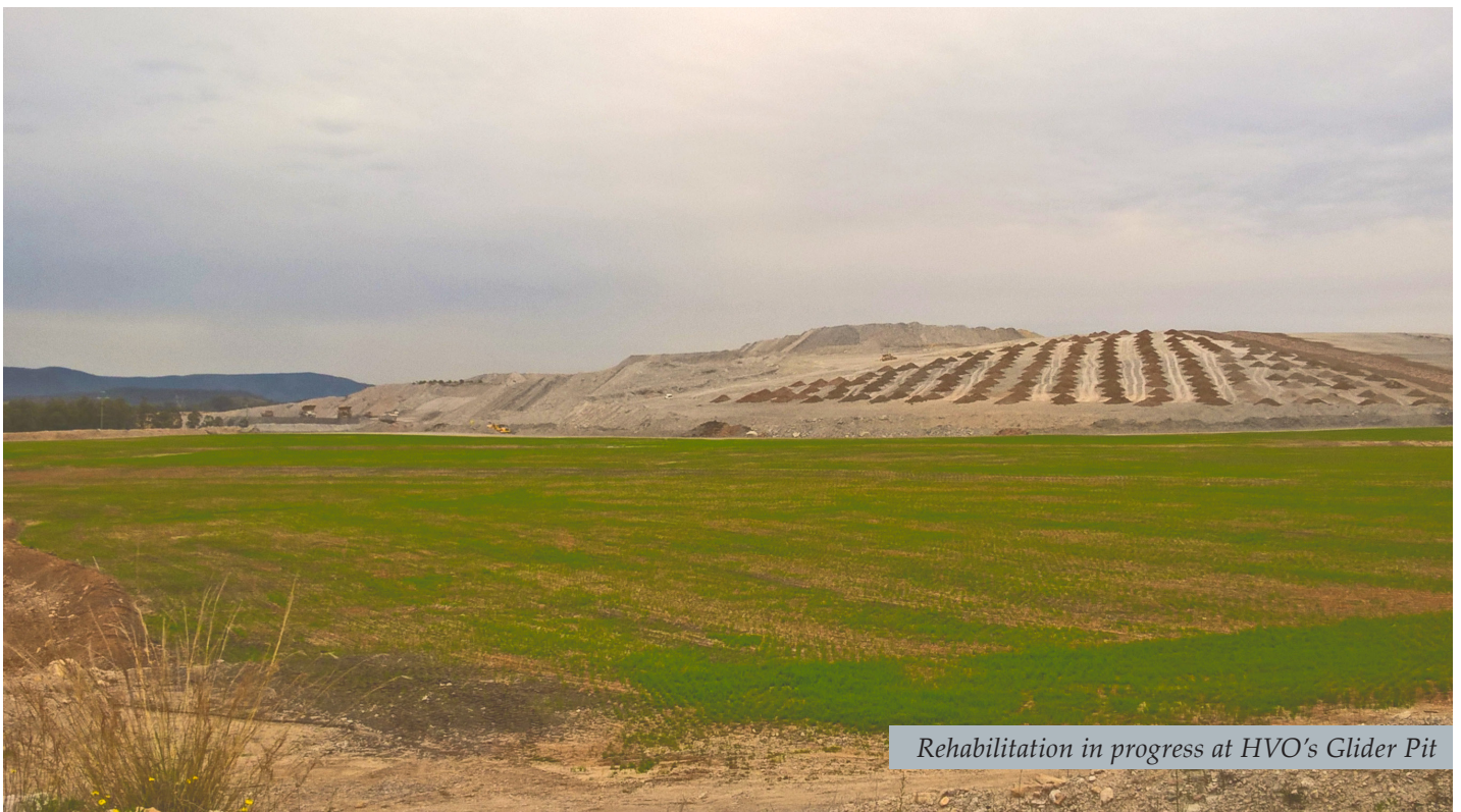
Rehabilitation in progress at HVO's Glider Pit